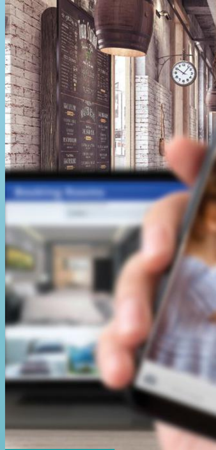
MONOFOCAL LENS Distance Only